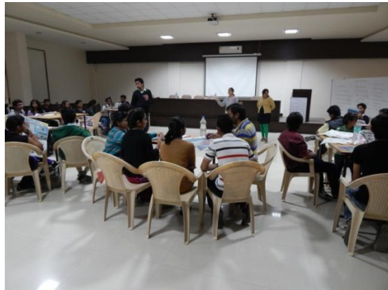
Participants of Saffrony Institute during the session.