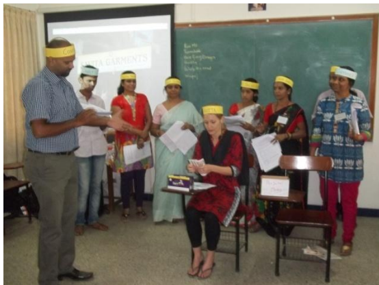
Savita Saree Shop – Role play