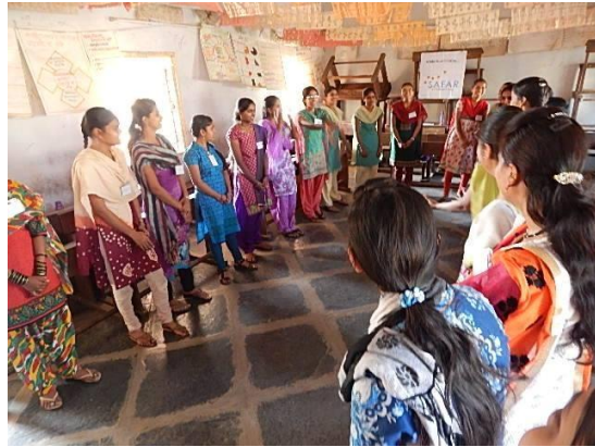
Participants playing a game during the session

"Education should not be the filling of a pail, but the lighting of a fire." William Butler Yeats