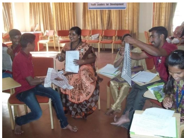
V Lead participants during the negotiation game.