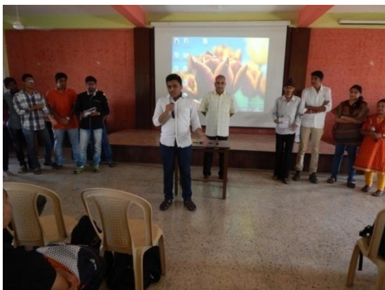
Participants of St.Xaviers debating the pros and cons of Entrepreneurship