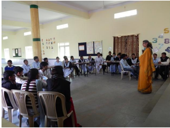
Students of Ashadevi College during the session.